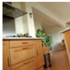
KITCHEN AND BATHROOM