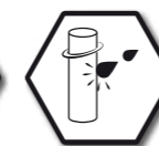
TRIPLE CHROME LAYER